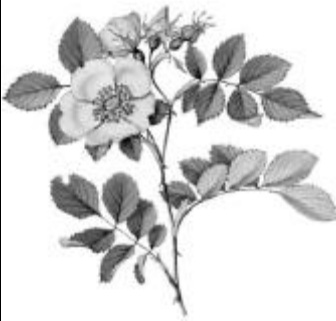
Dog Rose Rosa canina